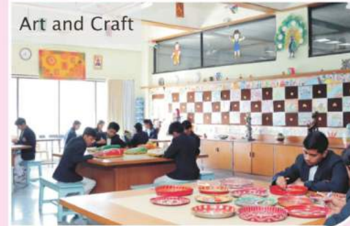
Art and Craft