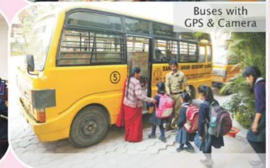
Buses with GPS & Camera