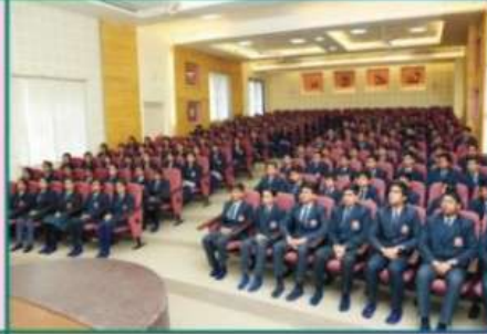
Airconditioned AV Hall