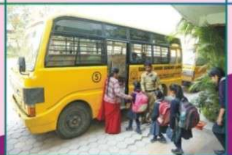
Buses with GPS, Camera & Lady Attendant