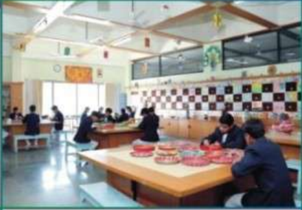
Art and Craft